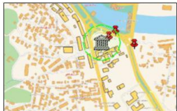
Figure 2: Coverage Area of School Zone in Old Tbilisi District

As shown in Figure 4 this petrol station is risky to the school and Public School No 20 also has the same problem like this. Appealingly, buffer is a technique that is useful for school zone analysis and probable future problems can be foreseen easily.